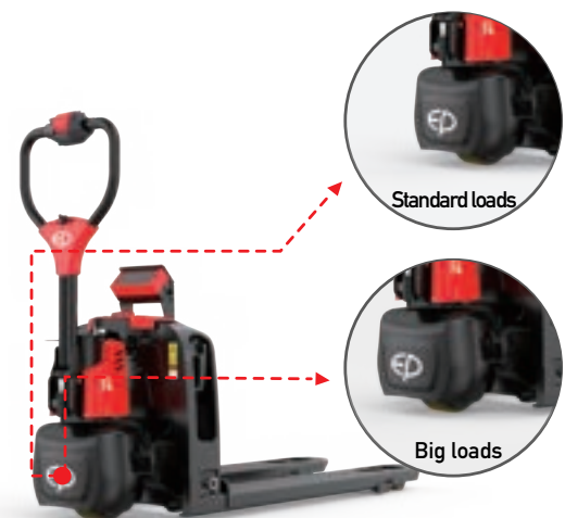
Stablizing wheel option