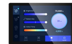
Tablet PC (Android APP, IOS APP)