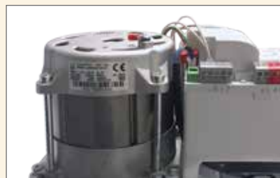
Sturdy and performing motors